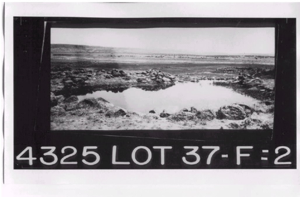
This shows the springs at Blackrock prior to development the Blackrock Dam. Spring-fed pools were common along the entire Zuni River.